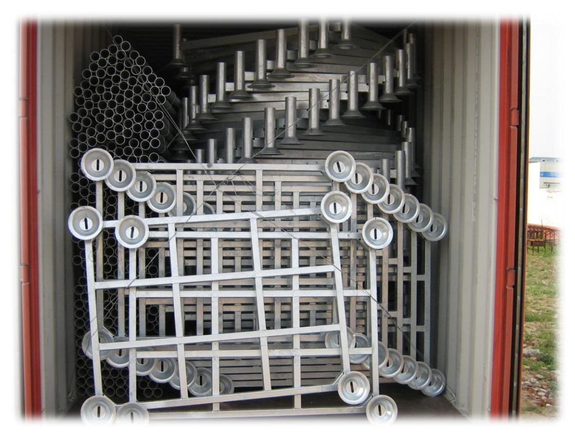
Because the freight of this produce is calculated with volume, so 40' container is economical choice.